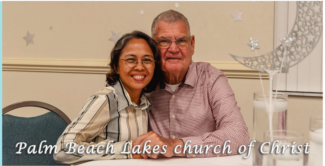
Palm Beach Lakes church of Christ