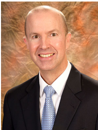
By David Sproule

Read Acts 2:38. How serious would it be if you refuse to repent and be baptized for the remission of your sins?